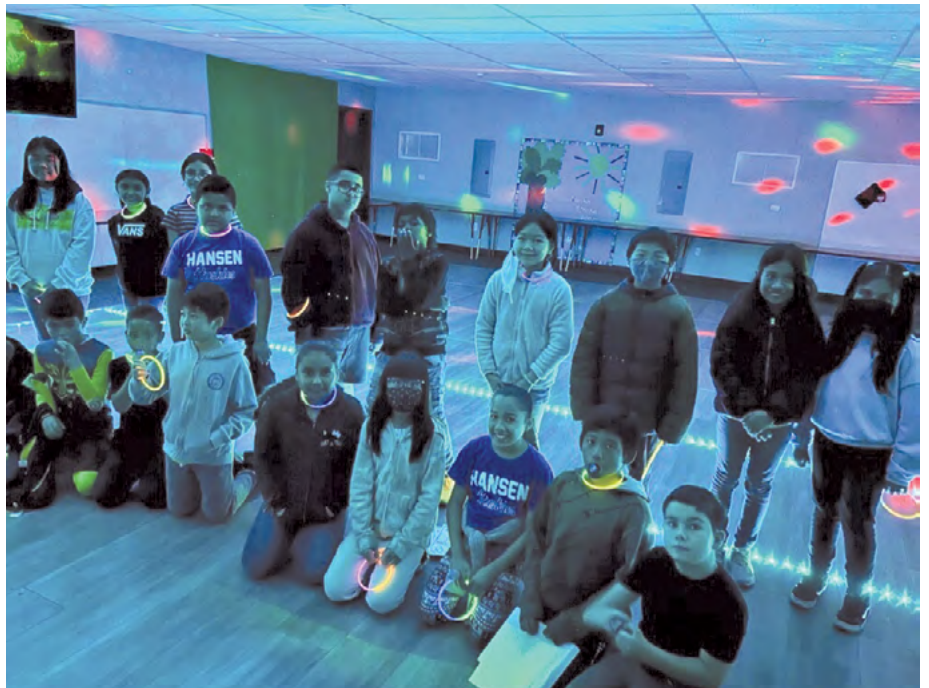
2nd grade students enjoy the Dance-a-thon's Glow in the Dark Dance Party.