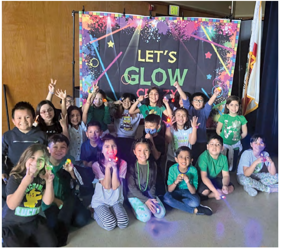
4th – 6th grade students traded in PRIDE cards to join the Upper-grade Experience. This trimester's activity was glow in the dark bowling.

After a 3-year hiatus, the Hansen Dance-a-Thon was back and bigger than ever. This school-wide fundraiser helped raise money for activities and programs that support student learning. This included assemblies and field trips. For all their hard work, each grade level was treated to a fun Glow in the Dark Dance Party, where our Hansen Huskies showed us their best dance moves. The joy on the students' faces was priceless as the music played and the students followed along to fun choreography. We sure do have some talented Huskies! We are excited to continue this wonderfully exciting opportunity and to give back to the students we serve at Hansen School.