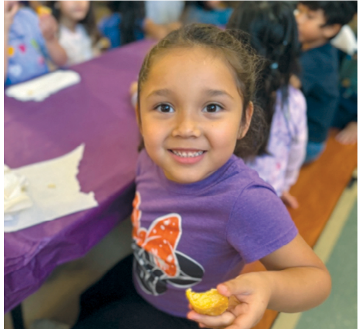
A student’s first taste of kumquat marmalade on a biscuit. She said it was awesome!

WINGS students had the opportunity to learn about some winter themed fun in January and February. They started with learning about the adaptations of polar bears by submerging their hand in icy cold water while wearing a glove made with a protective layer of fat. They also learned about the science concepts of snow skiing and put that knowledge to the test with their own winter Olympics STEM challenge creating “skis” and a foil lined “ski slope.” They also created robot winter challenges and participated in a culminating competition to see whose robot could reach the finish line the fastest. We didn’t forget the winter art! While students created several art projects over the last few months, one of the favorites was a winter birch tree scene created with painter’s tape and a watercolor wash effect.