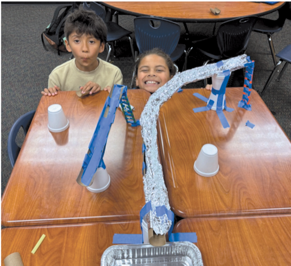
Students trying to create a “ski slope” for their STEM challenge.

Savanna WINGS students have recently begun to bring their Harvest of the Month experience to a whole new level. January was their chance to taste kumquats. While students were surprised that kumquats were eaten whole (skin and all) they were even more surprised that they were delicious when turned into a marmalade. Students from Transitional Kindergarten to Sixth Grade carefully sliced and seeded the tiny, tart citrus fruits and then watched as they were boiled with orange juice to create a wonderful sticky, sweet marmalade. They enjoyed it spread on a freshly baked biscuit! In February, students were able to try bok choy in a couple of savory dishes. They sliced bok choy and minced garlic. Their hard work paid off in a delectable wonton soup and sautéed lemon-garlic bok choy. It’s always a joy to see students experience dishes they might never have experienced!